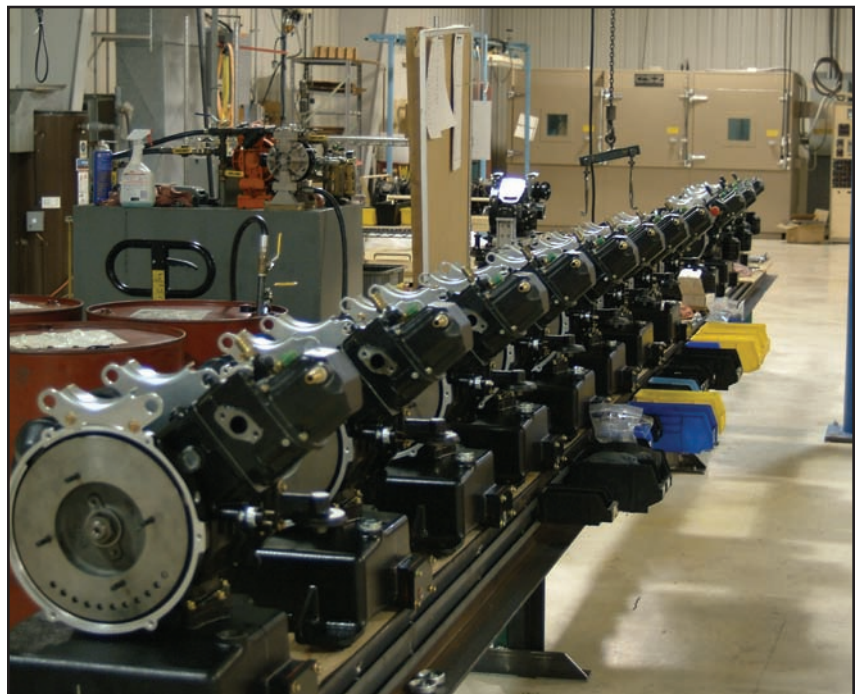
Marathon assembles the 5K engine and the CHP sets at its 67,000 sq.ft. facility in East Troy, Wis.

Marathon assembles the systems at its 67,000 sq.ft. facility in East Troy. Recent installations for the company include Ecopower units installed at a luxury home in northern Wisconsin and a Canadian canoe outfitter, along with a new contract with an Irish telephone service organization to supply units for prime power in cell towers. The company has over 500 units placed throughout Europe and expects to triple this number in the next two years. ★